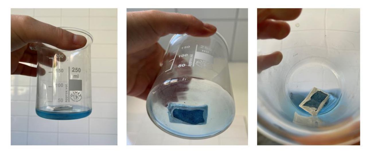
Figure 2 Released indigotin dye from layered material after 25 minutes

During the next 96 hours, the release of the indigotin dye from the layered material into water environment was observed. In the first 25 minutes, a larger amount of dye as observed to be released from the lower layers of the material ( Figure 2 ), this is so called burst effect.