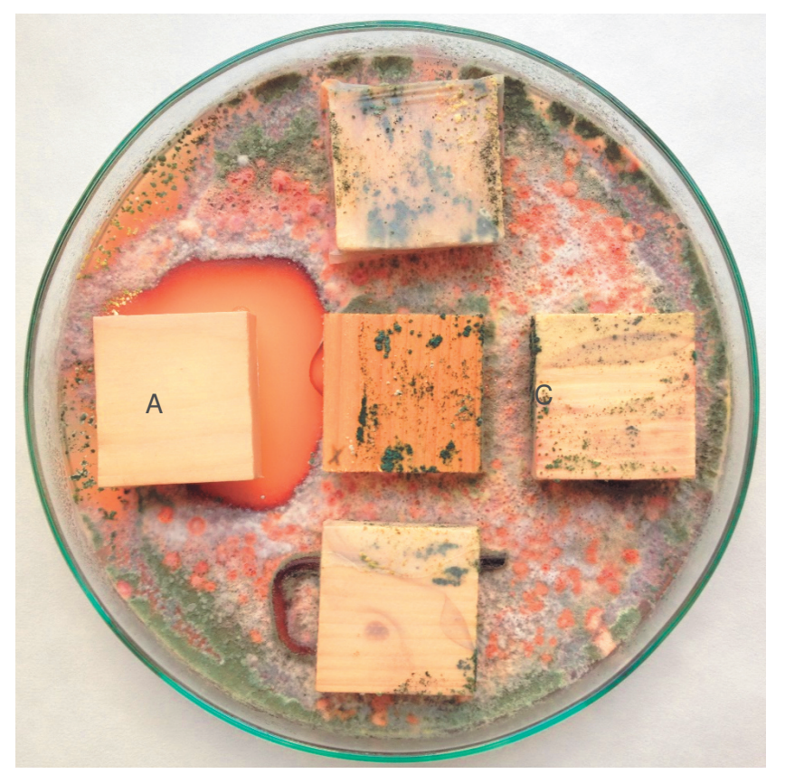
Figure 2 Plate with wooden samples at 11th day of experiment