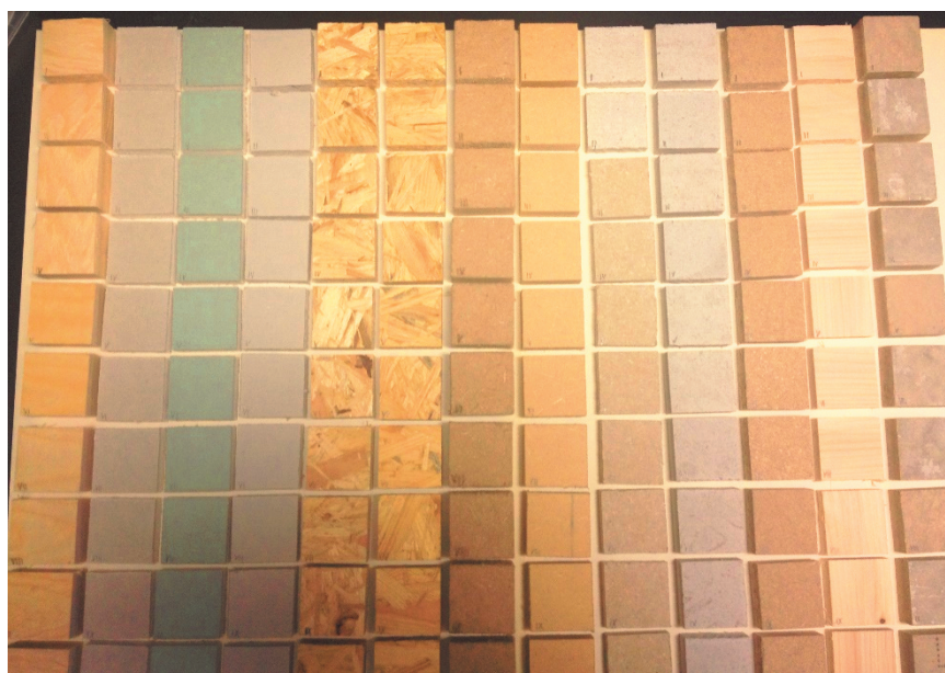
Fig. 1 Used building board materials before treatment application

especially in the middle of Czech Republic including Trichoderma , Penicillium , Alternaria , Paecilomyces received from before study (unpublished data). They were isolated from samples taken in the air exposition. But the molds used in experiment were received from a Czech Collection of Microorganisms (CCM).