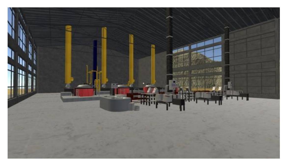
Figure 3 Virtual Foundry [own elaboration]

The resulting device models in the virtual foundry application are interactive according to the specification ( Figure 3 ). Click on the melting furnace to display information about the furnace, temperature, melt size and its purpose. Furnaces are regulated by thermocouples using PLC. Other equipment includes: Casting molds for casting aluminum alloys, holding furnaces (same regulation as melting furnaces), gravity casting table and NTL casting mold, and finally an adjoining office building.