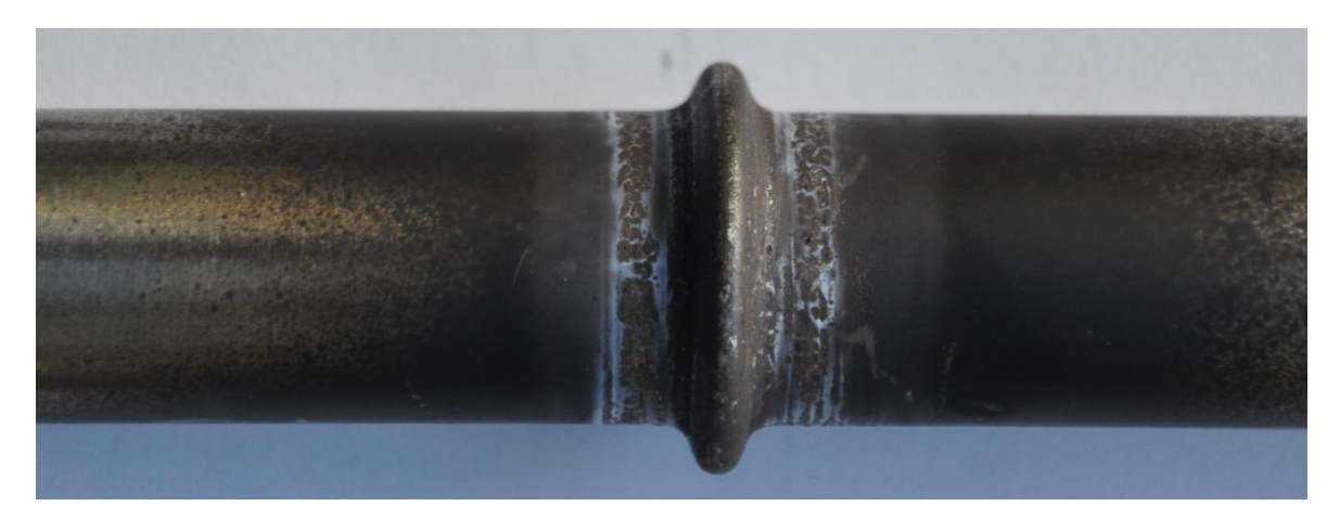
Figure 3 The final element manufactured during experiment (compressive length s=10 mm)

The final product after laser forming is shown of Figure 3 and the process description is below.