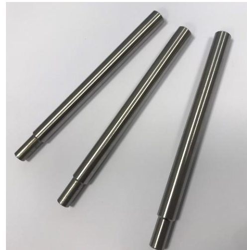
Figure 1 a) Measured static B-H hysteresis curves of the analyzed materials; b) material samples