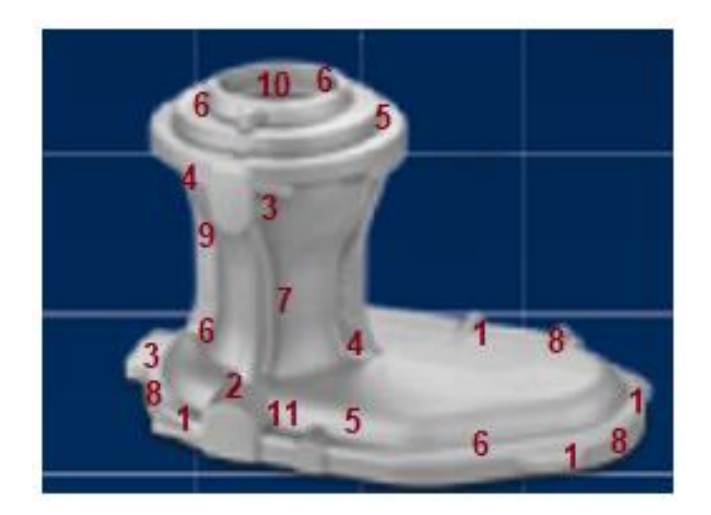
Figure 2 Identification of critical areas of the analyzed casting together with the determination of nonconformities: 1 - underfill; 2 - shrinkage cavity; 3 - gas bubbles; 4 - hot cracks; 5 - ripples; 6 - sandiness; 7 – a dimensional inconsistency; 8 - mechanical damage; 9 - cold cracks; 10 - foreign material inclusions; 11 incorrect or illegible marking of the casting

The first step of the analysis was to identify the areas in the casting ( Figure 2 ) where the most common defects occur, along with the type of these defects.