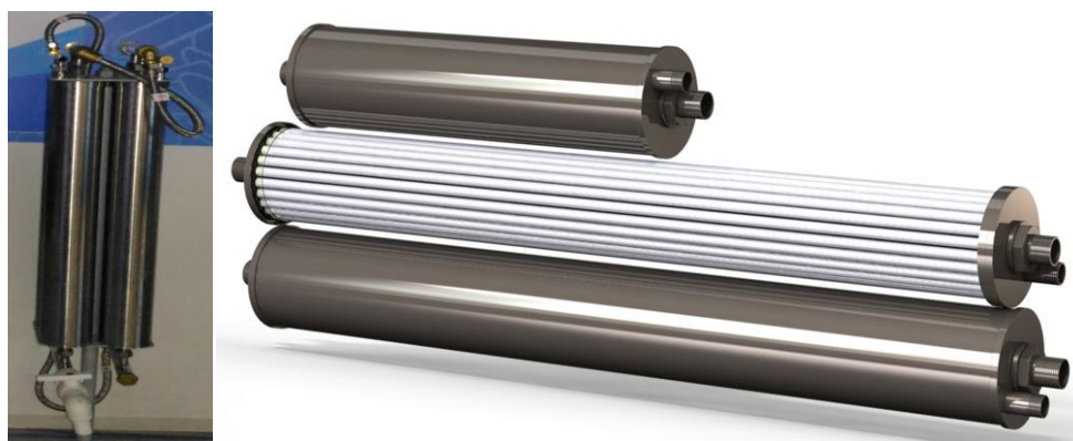
Figure 3 - Ceramic membrane element assembled and in section.

The use of a GDHC device promotes the insoluble state of Fe^{2+} Mn^{2+} compounds due to their oxidation, allows efficient oxidation of various substances (hydrogen sulfide, organic substances), and helps to reduce the total hardness of water by changing the ratio of hydrocarbonates and carbon dioxide. The insoluble compounds formed during processing are effectively removed from water during filtration through ceramic membrane elements with a pore size of 0.07-0.2 \mu m (Figure 3) [9].