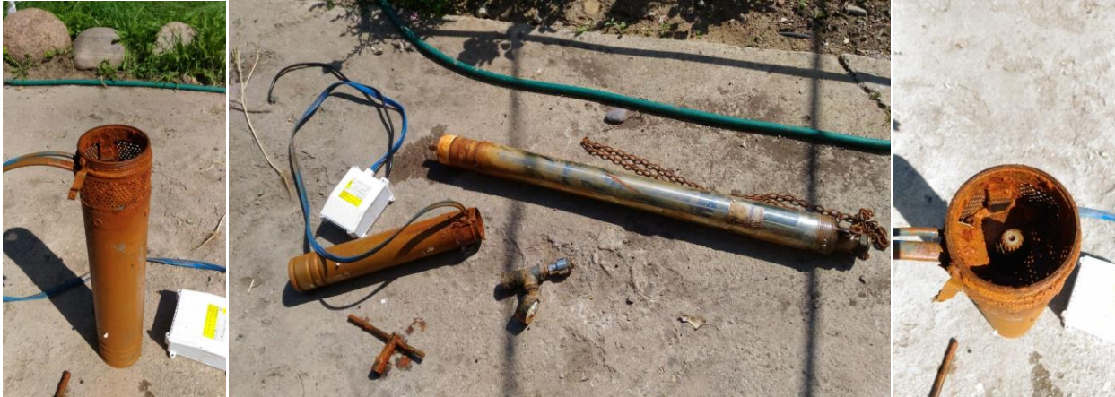
Figure 1 - Photo of a failed borehole pump due to the high content of \text{Fe}^{2+} compounds in artesian water

Along with \text{Fe}^{2+} compounds, natural water contains accompanying \text{Mn}^{2+} impurities, which can cause blockage of pipes and significantly reduce the heat exchange characteristics of technological equipment. The presence of hardness salts in natural waters also has a negative effect on the heating surfaces of heating equipment, forming hard-to-remove Ca and Mg compounds on the surface.