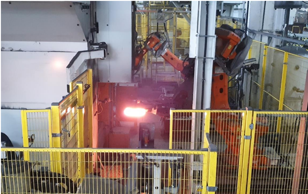
Figure 2 Industrial robot in the forge of crankshafts [own study]

It is important to have deep understanding of the processes that need to be automated in order to specify each individual task. Therefore, the cooperation of many senior experts from various branches of automation is important. These engineers bring important know-how, which ensure the smooth implementation of the automated system in compliance with the agreed deadlines and without unnecessarily increasing costs [9].