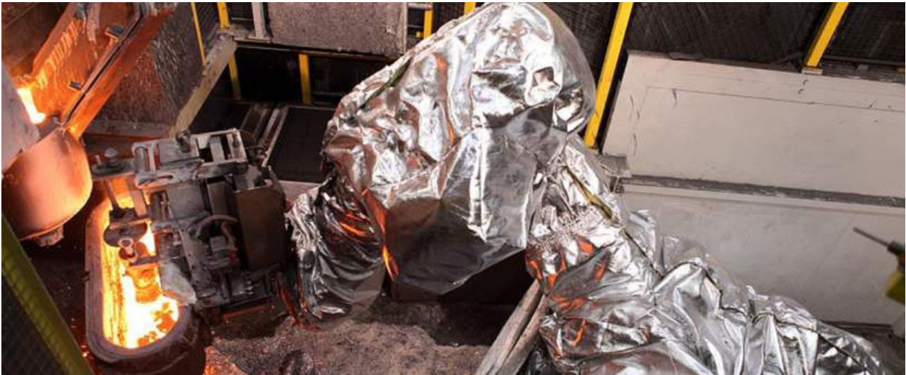
Figure 1 Robotic aluminum cover jacket that suits foundry and forging [2]

Another integral part of the robot, which is exposed to extreme conditions, is a robotic gripper. Gripping tools must withstand high temperature, therefore grippers are made of special materials in order to cope with extreme production conditions and handle parts weighing up to 300 kg. Robot grippers are the physical interface between a robot arm and the work piece. Grippers are tailored made to meet the individual requirements of specific applications. Depending on the application, they can be operated either pneumatically, electrically or hydraulically [3]. Regardless of the type and method of operation, grippers must handle parts quickly and reliably [4-6]. As Smalcerz states in his work, during pyrometer measurement the temperature of the industrial robot arm and particularly the temperature of the gripper fingers (physical contacts) can reach more than 70 °C, the adapter did not reach the temperature exceeding 45 °C, and the TCP was heated to about 35 °C [7].