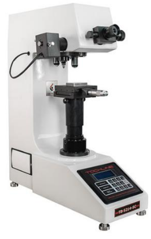
Figure 2 Vickers hardness tester

The measurement is carried out as follows: set the test sample coated on a stage and select a place for printing, then release the screw and gently turn the stage counterclockwise until it stops, avoiding jolts when approaching the stop, fasten the table in this position by slow rotation the handles counterclockwise lower the stem so that the diamond tip touches the surface of the test sample, the handle is rotated about 180 ° and held for 10-15 seconds, after exposure to a load (0.5 kg), turn the handle to its original position, then release the screw and very carefully turn the object table to its previous position until it stops, measure the control parameter of the print using a photoelectric ocular micrometer, calculate the microhardness of the coating according to the formula (1).