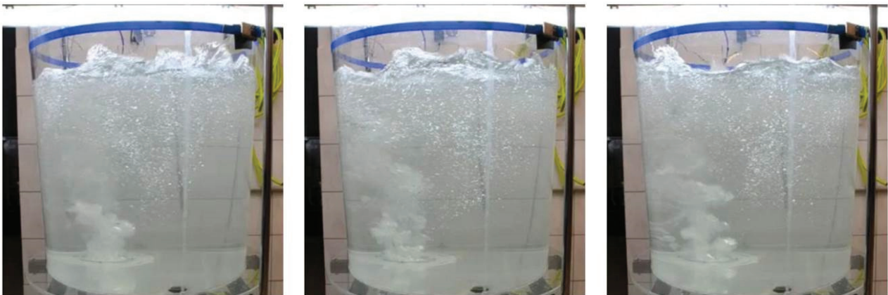
Figure 2 Exemplary results of visualization - view in the axis of purging plug

Before modelling research the series of experiments were conducted which the main aim was to verify the working efficiency of ladle model and control-measuring apparatus considering the research assumptions. After correction of small defects the experiments, which have the visualization character, were conducted. Research was carried out in series, registering its course by means of digital camera in two planes. Such research was divided into two stages. The aim of first stage was to determine the hydrodynamic conditions in the model of ladle prototype, caused by the intensive blowing of the modelling liquid by gas. In the second stage the time of tracer mixing in whole modelling liquid was determined. Figures 2 and 3 show the exemplary research results of visualization conducted in the first stage of research.