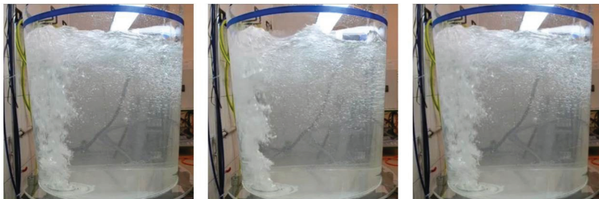
Figure 3 Exemplary results of visualization - view from the side of the purging plug

To determine the minimal time of modeling of liquid mixing during the process of gas blowing, tracer (in the form of water solution of \text{KMnO}_4 ) was introduced to the model. The tracer was introduced together with the gas stream. Figure 4 presents the exemplary results of those experiments.