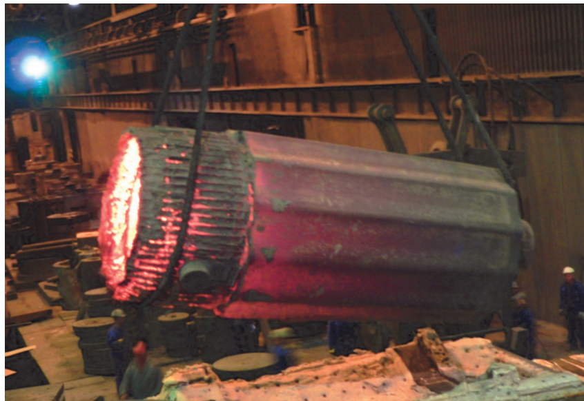
Fig. 2 Transportation of ingot 1195 to the Forge store (adapted to [6])

The metallurgical industry in a broad sense and a metallurgical company in particular outlines and links, is a closed loop of business processes, with high levels of physical and mental performance. This fact affects both the production of steel itself, but also its further processing and not least shaping the final form of the finished product, its refinement and handling activities in individual overlapping processes. Physical and mental stress in a metallurgical enterprise are divided and influenced by the degree of automating various processes and we can say that they mostly operate in parallel. After all, transport of heavy glowing forgings, see Fig. 2 , for example, causes both of these types of stress.