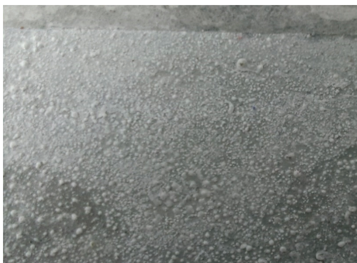
Fig. 1 Detail of the dusty substrate surface with a coat after a 100 hours corrosion test