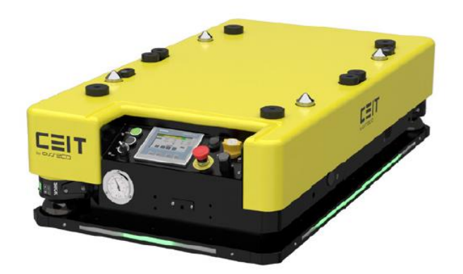
Figure 1 The unit load AGV designed by Asseco CEIT (1200F) [1]