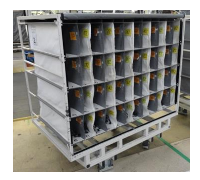
Figure 2 Examples of used rolling picking carts

Material and parts are transported to the line from the warehouses or with the Just-in-Sequence (JIS) concept. The flow of parts is controlled by requests when the signal stock of parts on the line is reached. There are two picking carts for each part on the assembly line. Assembly parts are taken from the full picking cart. An empty picking cart is exchanged for a full one based on the request system. Picking carts are transported to the assembly line by automated tugger trains (towing AGV with automated C frames), tugger trains with drivers or manually. Manual handling is performed from a warehouse located near the assembly line. The line operates at a rate of 57 s, which represents the exchange of picking carts 173 times per shift. Other handling equipment (forklifts, other tugger trains) and pedestrians that are not related to the given line move in the area of the line and warehouses. There is also a charging station for towing AGV in the assembly line area.